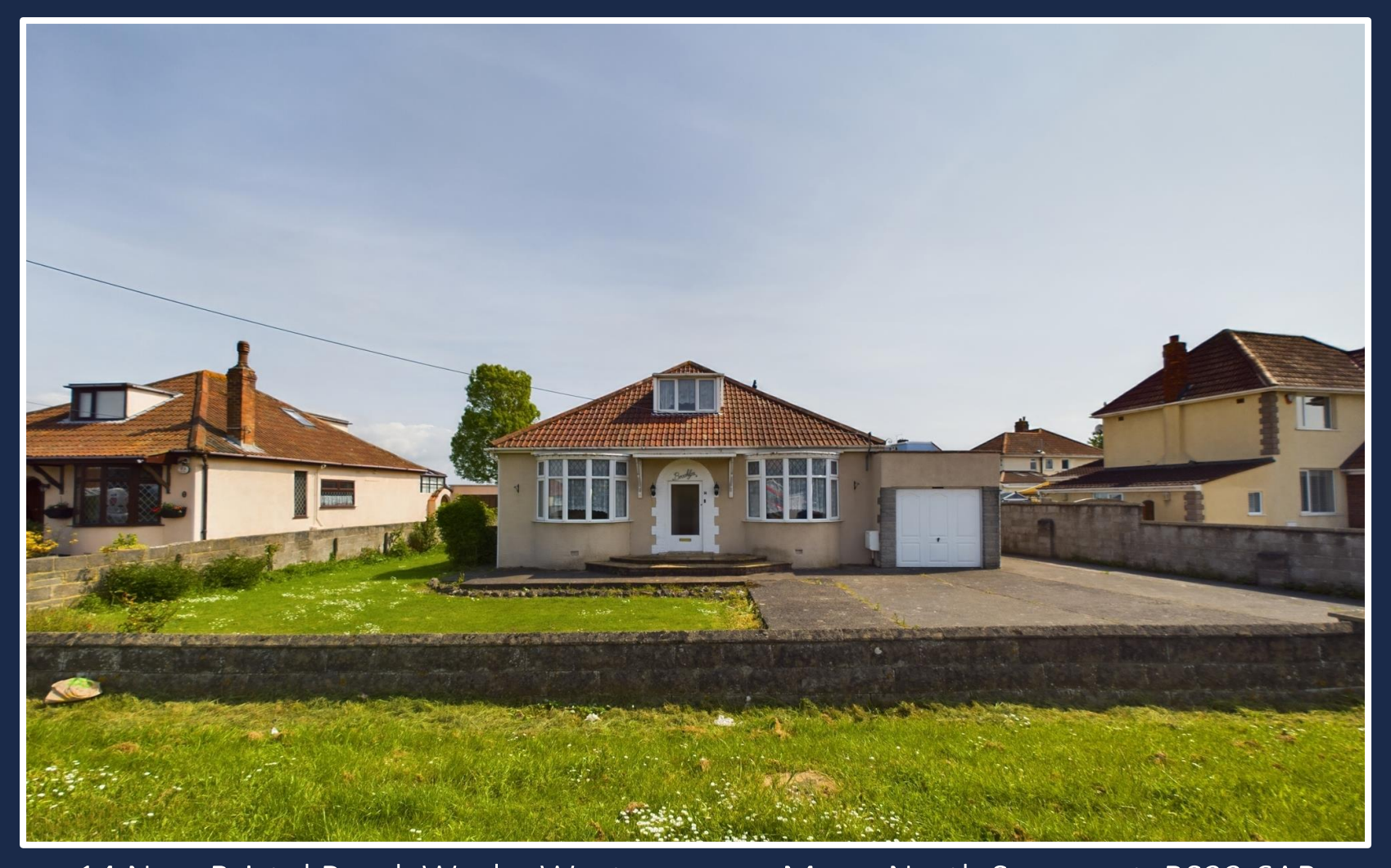
14 New Bristol Road, Worle, Weston-super-Mare, North Somerset, BS22 6AB